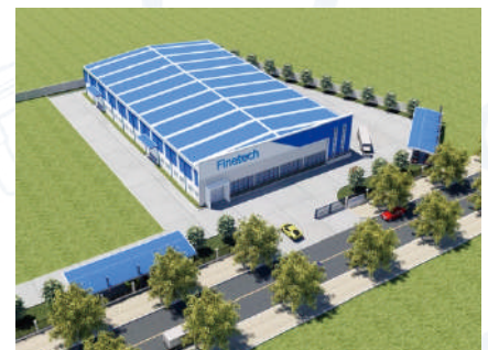
New factory under construction in Vietnam